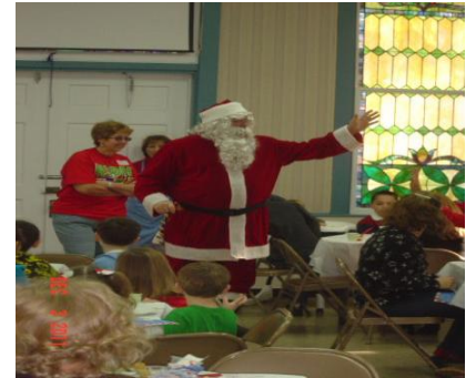
Santa has arrived