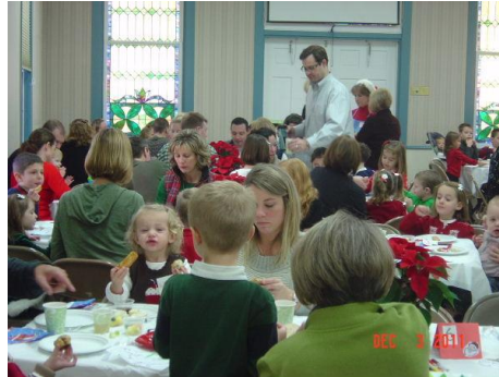
All Enjoyed the treats